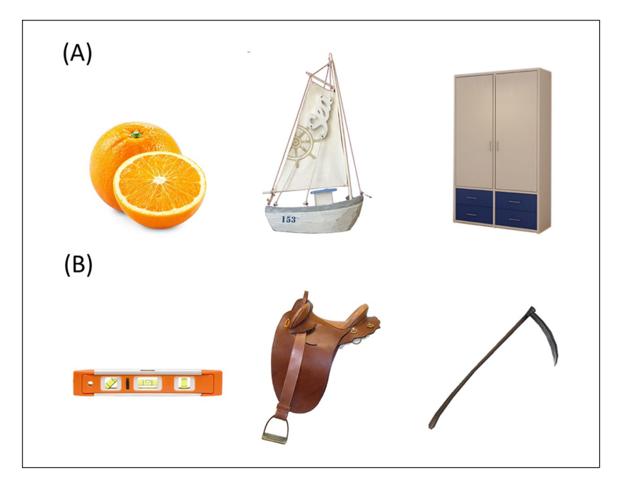
Figure I. Examples of the study material: (A) images of familiar objects, and (B) images of unfamiliar (rare) objects.

4 \text{ cm}^2 , and they appeared at the center of a 15-inch color monitor (Compaq laptop computer) against a white background. On each trial, a small symbol (2 \text{ cm}^2) appeared 2 cm above the study picture. The symbol indicated the appropriate learning condition for that item; a mouth (lips) with an X mark on it indicated the no-production condition and a mouth indicated the production condition. Note, we used these symbols across all experimental tasks (regardless of the study material) to avoid confusion and reduce the likelihood of participant errors.